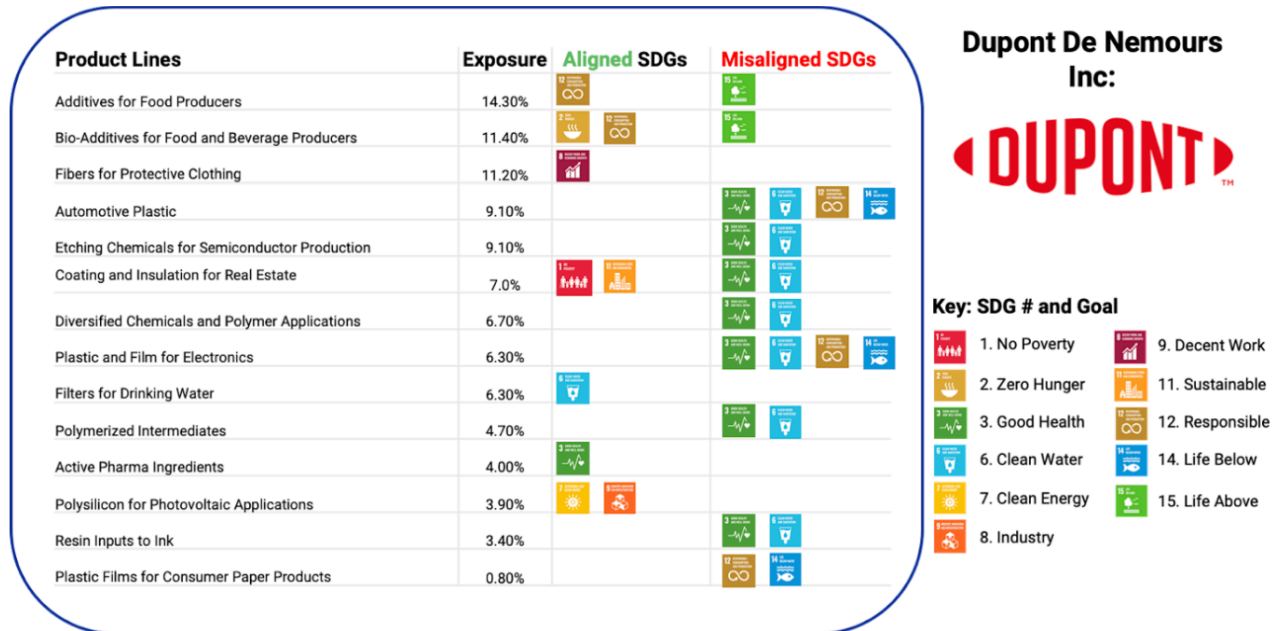
Revenue exposures based on classification data as of 12.31.2020.

to provide clarity and transparency, the Affinity Platform enables investors to identify and assess the SDG alignment or misalignment of not only individual companies but their underlying product lines, as shown in the exhibit below.