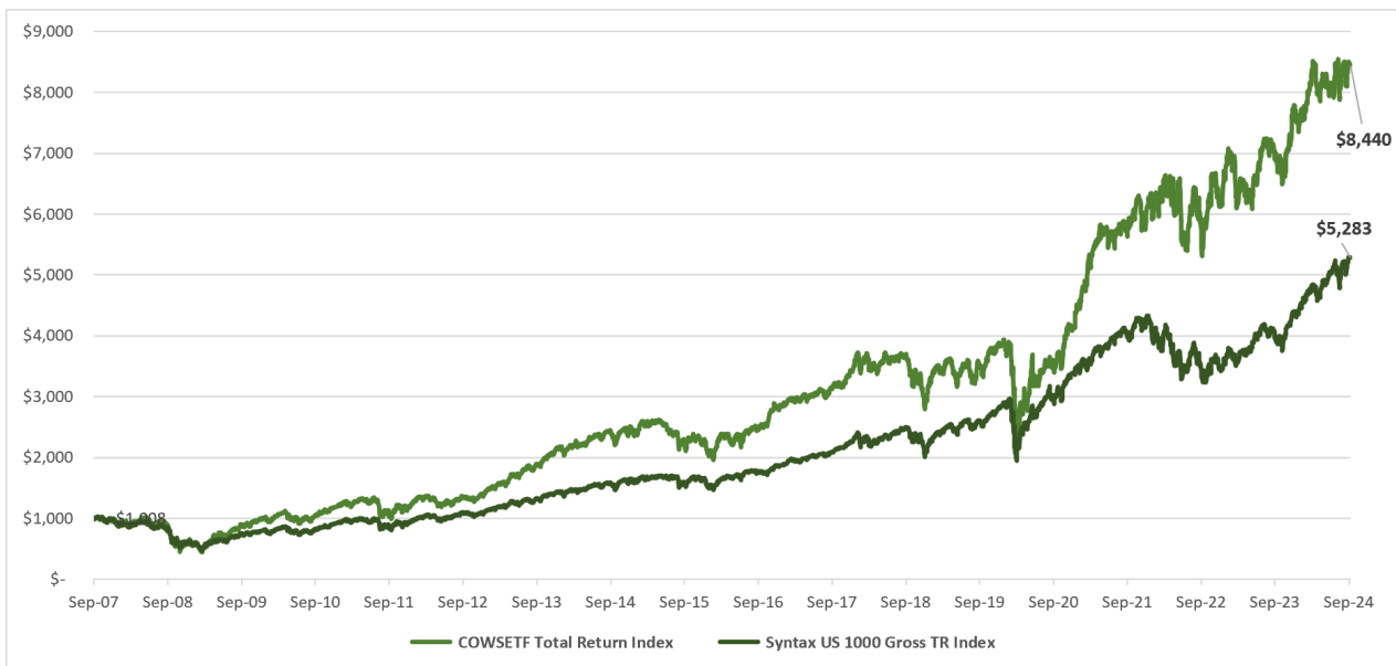
Exhibit 2: Hypothetical Growth of $1,000 Investment: Kelly US Cash Flow Dividend Leaders Index vs. Syntax US 1000 Index

Total Return, 7/26/2023 - 9/20/2024. Performance does not reflect fees or implementation costs as an investor cannot directly invest in an index. Please see important disclaimers regarding back-tested data prior to inception on 7/26/2023.